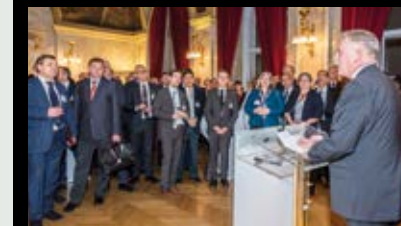
The celebration of 20 Years Wassenaar Arrangement took place at the Austrian Foreign Ministry in December 2016.